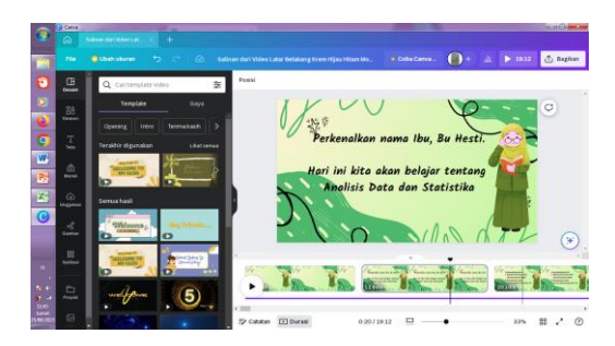
Figure 2. Display of Video Animasi Media